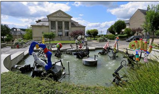
CHÂTEAU-CHINON (Fontaine Niki de Saint Phalle et Mairie)

Saturday 30 September : departure of delegations