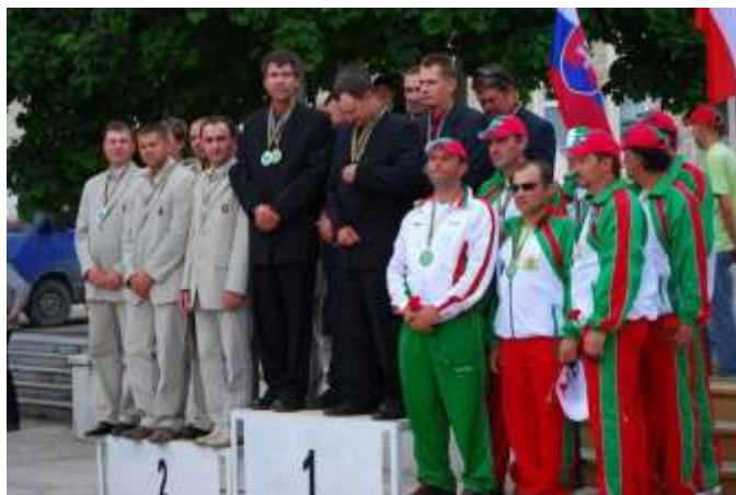
6th WORLD CHAMPIONSHIP CARNIVOROUS ARTIFICIAL BAIT SHORE ANGLING FOR NATIONS, DEVIN – 2008